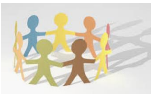
TOGETHER WE ARE MAKING A DIFFERENCE!

Members are required to dress up on the days of the meetings in business world attire.